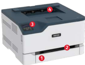
Xerox® C230 Colour Printer