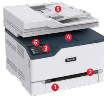
Xerox® C235 Colour Multifunction Printer